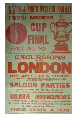
Poster, London & North Western Railway, Football Association Cup Final, 29 April 1922 Excursions to London, red text with football and FA Cup on white background, printed by Thos Cook & Son, Ludgate Circus, London, EC4. Format: double royal. Dimensions: 40 x 25 inches, 1016 x 635mm.