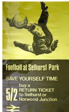
Poster, British Rail (Southern) poster,(Football at Selhurst Park), Top Half - Yellow with black sketch of footballer in flying header, Bottom half - black with yellow printing, Text - Title and "Save yourself time. Buy a 5/2 Return Ticket to Selhurst or Norwood Junction, Pre 1971.