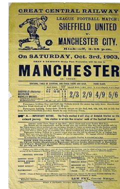
Timetable & fares. League Football match: Sheffield United V Manchester City. Great Central Railway. 1903 Object no. 1998-11566