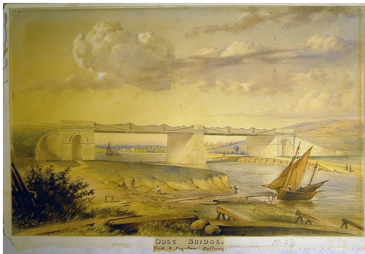
1978-1581 Watercolour. Ouse Bridge, York & Scarborough Railway